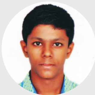
English Literary Association Student Leader