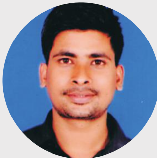
Graduation Level Student of the Year 2016-17