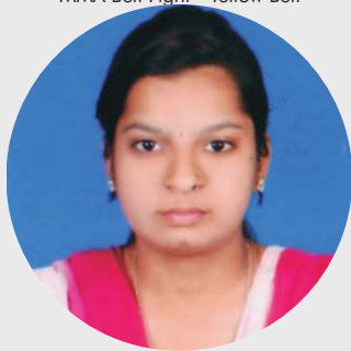
Gupta Jagriti Best NSS Volunteer Girls