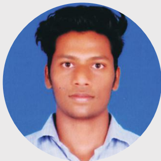
Datta Bhurunagi International Chess Boxing-Silver Medal National Inter College Championship-Gold Medal State Level Kick Boxing - Two Time Gold Medal District Kick Boxing - Gold Medal MMA Belt Fight - Yellow Belt