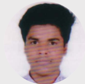
English Literary Association Student Leader